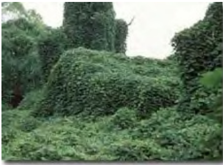
Figure 2: House in downtown Tate, GA.

The problem is that it just grows too well! The climate of the Southeastern U.S. is perfect for kudzu. The vines grow as much as a foot per day during summer months, climbing trees, power poles, and anything else they contact. Under ideal conditions kudzu vines can grow sixty feet each year.