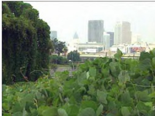
Figure 1 Kudzu outside of Atlanta, GA

Kudzu was introduced to the United States in 1876 at the Centennial Exposition in Philadelphia, Pennsylvania. Countries were invited to build exhibits to celebrate the 100th birthday of the U.S. The Japanese government constructed a beautiful garden filled with plants from their country. The large leaves and sweet-smelling blooms of kudzu captured the imagination of American gardeners who used the plant for ornamental purposes.